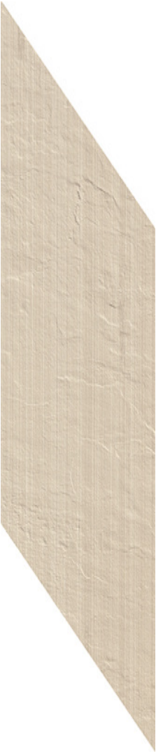
AVORIO (Ivory) 18.75 x 57.6 cm (7 x 23) Chevron OE.AM.AVO.0723.CHEV