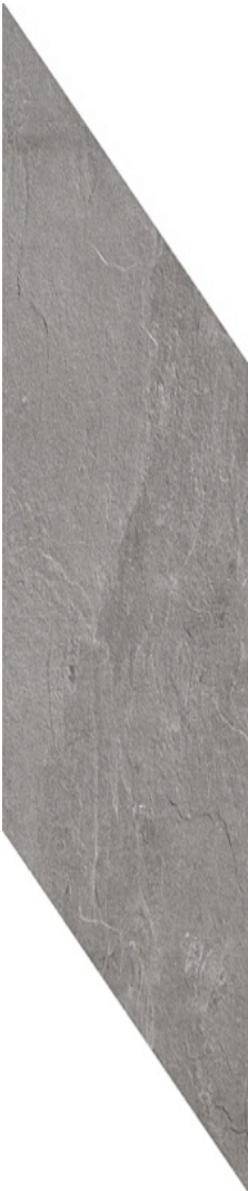
CENERE (Grey) 18.75 x 57.6 cm (7 x 23) Chevron OE.AM.CNR.0723.CHEV