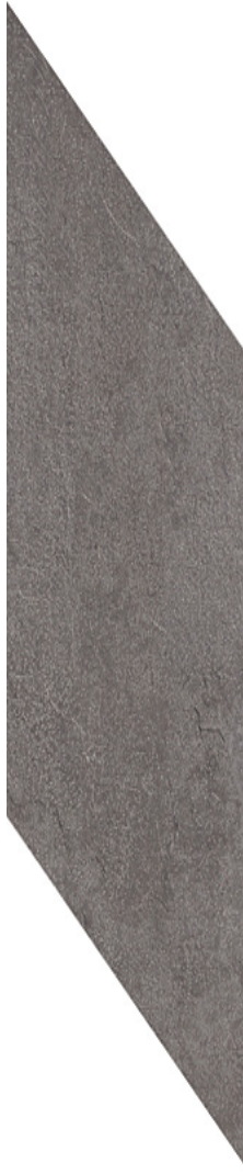
ANTHRACITE 18.75 x 57.6 cm (7 x 23) Chevron OE.AM.ATR.0723.CHEV

All items shown in this document are part of Olympia's stocking program. For special orders, please contact your Olympia Tile Sales Representative.